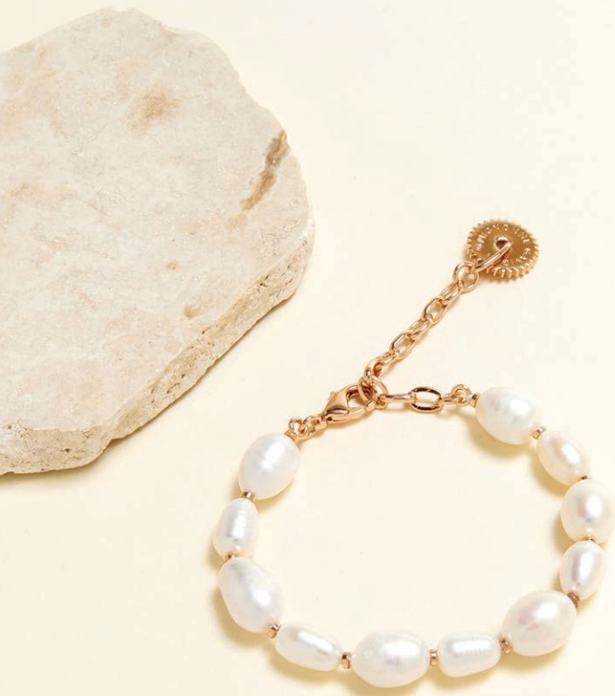
Mignonne Gavigan bracelet in pink and white