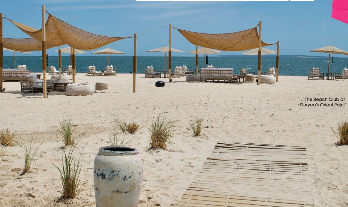
The Beach Club at Duryea's Orient Point