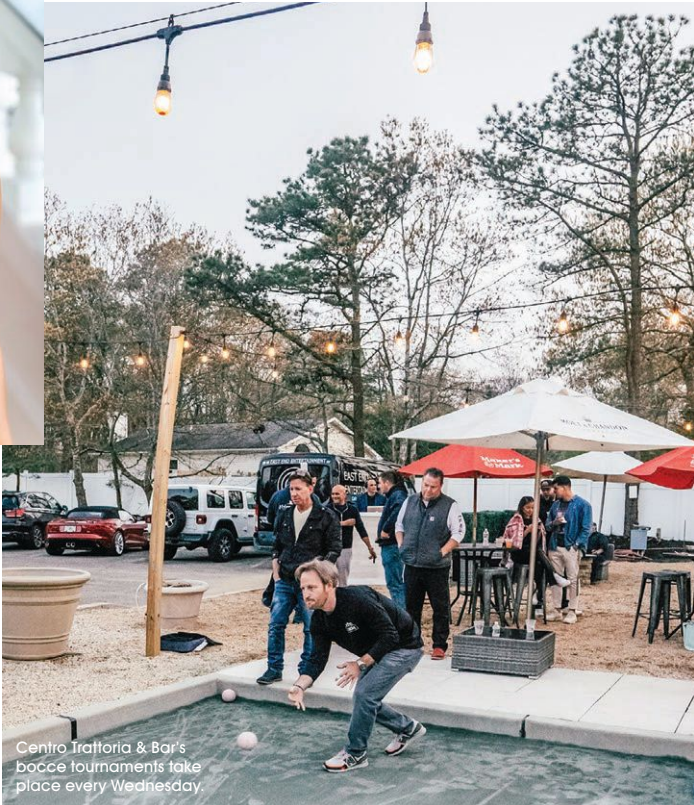
Centro Trattoria & Bar’s bocce tournaments take place every Wednesday.

Whether worn seaside or poolside, Verandah’s summer sustainable swim and resortwear collection is best known for its beautiful handillustrated prints. This female-owned and operated luxury label has made it its mission to promote sustainability through fashion with 100% Italian-made maillots and bikinis created from Econyl yarn. Stand out this summer knowing each ethically handcrafted luxury piece pushes toward Verandah’s goals of zero waste, fair trade compliance and support of fellow artisans. studioverandah.com